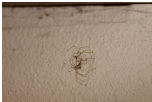
A spider exoskeleton?

How many of these spooky spider items can you find?