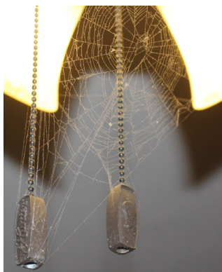
An orb web?