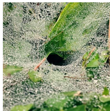
A funnel web?